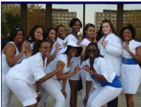
OD Sorors w/ TPZ Soror Peace, an OD alum

We know you will work hard to continue the advancement of Zeta on campus