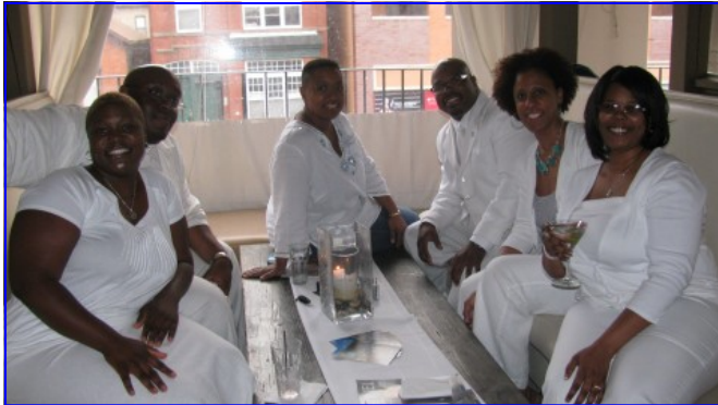
TPZ at Iota Nu Sigma's All White "Blue Tuesday" at Crimson Lounge