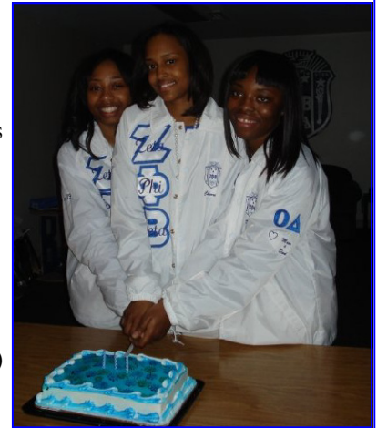
Welcome to the sorority!