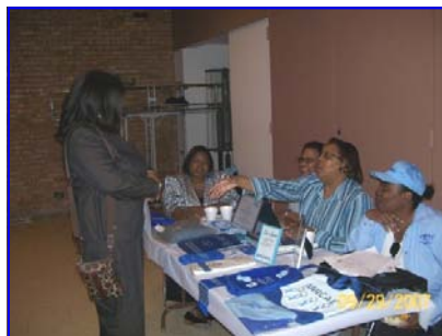
Amicae of TPZ welcoming a friend to the reception

The Amicae returned from the summer break energized and ready to get back to work. At TPZ's 2nd Annual Welcome Back Reception, held at the Harris Park and Recreation Center on September 29 th , the Amicae came out to talk to women interested in joining the auxiliary. The ladies set up a beautiful display table with information and paraphernalia about the auxiliary and made themselves available to answer any and all questions.