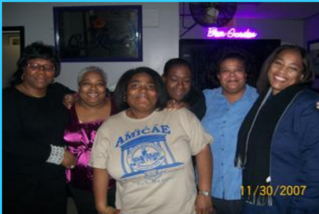
TPZ Amicae and friends at the Anniversary party

The Adult Auxiliary of Tau Psi Zeta Chapter