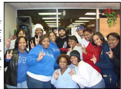
Sorors & "The Hot Boyz" of Power 92 at McDonald's dropping off Toys

Foundation, the Power 92 toy drive and three families in need.